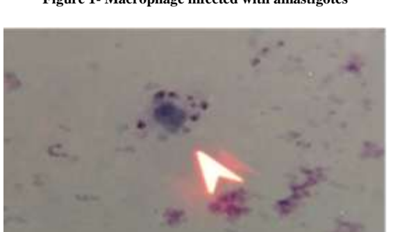
Figure 1- Macrophage infected with amastigotes

sterile conditions. Then, 200 µl of the tube contents containing 10<sup>4</sup> macrophages and 200 µl of L. major promastigotes at stationary phase were added to each well to infect the macrophages. Overall, 10^5 parasites were present in each well. After incubation at 37°C and 5% CO_2 for 24 hours (0rparasite/macrophage ratio of 10.1), a sterile sampler was used to remove the contents of plates containing un-adhered macrophages and parasites that did not penetrate into the macrophages. The RPMI 1640 medium and 10% FBS were added to the plates. The plates were investigated under inverted microscope to ensure that macrophages were infected (Figure 1) (17). After that, 200 µl of A. lappa root extract with concentrations of 500 and 1000 \ \mu g/ml was added to each well. In addition. 1000 and 10.000 ug/ml of Glucantime were added to each well, with four repetition. Each 5-ml ampoule of glucantime® contained 1.5 g meglumine antimoniate corresponding to 0.405 g of pentavalent antimony (Sanofi-Aventis, France). The two control wells only contained infected macrophages. Round lamellas were removed from the bottom of the 12-well plate after 24 and 48 hours of incubation at 37 °C. They were fixed with pure methanol and then stained by Giemsa. The number of amastigotes inside the macrophages was counted under a microscope using the 100x (oil immersion) objective lens, and the results were presented as percentages.