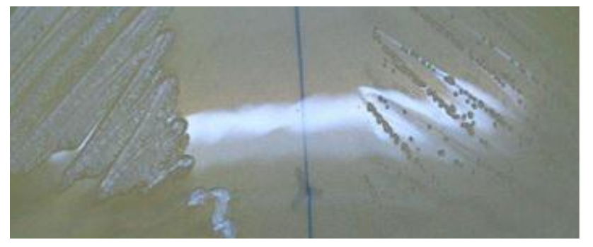
Figure 2- The growth of P. aeruginosa under normal growth conditions (left) and in the presence of NiNP/RPET NF (right) after 48 hours

was 0.464 \pm 0.021 after treatment with NiNP/RPET NF and 0.082\pm 0.011 in the absence of NiNP/RPET NF. This indicates the significant reduction of biofilm formation after exposure to NiNP/RPET NF (p=0.01). Figure 2 illustrates the antibacterial effect of NiNPs on the growth of P. aeruginosa after 48 hours.